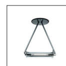
SCINTILLA SUSPENSION LAMP