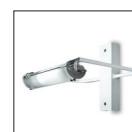
SCINTILLA WALL LAMP