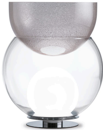
Table lamp with diffused light not dimmable. Chromed metal frame. Middle globe made of transparent blown glass. Inner globe made of glossy white blown glass. Top half-sphere made of transparent and coloured blown glass with decorative bubbles. Black power cable, switch and plug. European two-pole plug. Bulb not included.

Half vase, half lamp, Giova marks the debut of Gae Aulenti in the field of lighting design. Available in two sizes, it is both a lamp and a luminous sculpture. Positioned on a metal base is a transparent bowl containing a sphere, which in turn houses the light source. Placed above is a smaller bowl in blown pulegoso glass, meaning 'with irregular bubbles', which serves as a bottom vase.