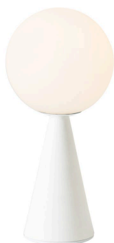
Table lamp with diffused light not dimmable. Painted metal frame. Diffuser made of white blown glass with satin-finish. Transparent power cable, plug and switch. European two-pole plug. Bulb not included.

Nothing more than a sphere, set in an apparently impossible feat of balance, upon a cone that serves as the base. One of Gio Ponti's many compositional magic tricks, designed in 1932. The counterbalancing of two elementary geometric forms results in an original, perfectly proportioned object. An unpretentious composition, enriched by the extraordinary balance of its proportions and the stylish discretion of non-reflective materials. The light is diffused and valorized by the geometrical simplicity of the design. In designing Bilia, Gio Ponti imagined a smaller version in a range of "spray colours". From those handwritten notes of the original project, FontanaArte presents Bilia Mini in new breathtaking chromatic variations.