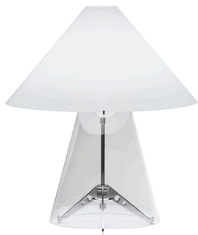
Table lamp with diffused and dimmable light. Chromed metal frame. Transparent blown glass base. Diffuser made of colored glass paste with frosted and blown glass. Transparent power cable, dimmer and plug. European two-pole plug. Bulb not included.

Metafora was born in the flourishing creative climate of the early '80s, when Gae Aulenti took on the role of artistic director for FontanaArte and decided to bring glass back to the forefront of the company's production. On Aulenti's invitation, Umberto Riva designed a precious table lamp consisting of a conical shade in layered opal glass supported by a transparent glass base that hides the metal frame, all interlocking. A highly decorative object, produced with traditional techniques like glass blowing and other examples of artisanal know-how, repropose today to a clientele ever more attentive to originality of design and its timeless expressions.