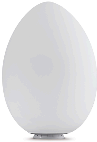
Table lamp with diffused and dimmable light. Diffuser made of white blown glass with satin-finish. Base made of white painted metal. Black power cable, plug and switch. European two-pole plug. Bulb not included.

A natural form and timeless symbol of perfection, in which symmetry and asymmetry harmoniously coexist. Designed in 1972, the 'shell' of the egg contained a light source: an ironic idea that still works today. As in nature, the shell of the Uovo lamp is the embodiment of absolute lightness, an elegant form in white satin blown glass that gives off a warm, uniform light. Available in three sizes, it has all the versatility of a collection designed for multiple uses: from the small version which serves as a tiny utility lamp to the large version, a veritable light sculpture, protagonist of any space.