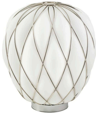
Table lamp with diffused and dimmable light. Enclosed diffuser made of frosted blown glass. Cage and base made of chromed metal. Transparent power cable, dimmer and plug. European two-pole plug. Bulb not included.

Pinecone is a suspension and table lamp. The diffuser is manufactured using the ancient caged blown glass technique: the glass maker blows the molten glass blob into a metal cage, which only partly contains the blob's natural expansion. In this way, the glass surface is partly trapped by and partly escapes the cage, generating an impression of tension as the object struggles to free itself from its harness; the cage is further enriched by the galvanic treatment that makes it look glossy and brilliant. The transparent version, in particular, reveals a two-fold structure that multiplies the scenic effect, while the metal cage pattern projects kaleidoscopic shade effects on the surrounding surfaces. On the contrary, in the white version the glass delicately envelops the cage surface and enhances its geometric pattern, generating an elegant and visually pleasing diffused light. The lighting fixture makes a highly appealing and striking impact either switched on or off.