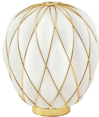
Table lamp with diffused and dimmable light. Enclosed diffuser made of frosted blown glass.. Cage and base made of galvanized metal. Transparent power cable, dimmer and plug. European two-pole plug. Bulb not included.

Pinecone is a suspension and table lamp. The diffuser is manufactured using the ancient caged blown glass technique: the glass maker blows the molten glass blob into a metal cage, which only partly contains the blob's natural expansion. In this way, the glass surface is partly trapped by and partly escapes the cage, generating an impression of tension as the object struggles to free itself from its harness; the cage is further enriched by the galvanic treatment that makes it look glossy and brilliant. The transparent version, in particular, reveals a two-fold structure that multiplies the scenic effect, while the metal cage pattern projects kaleidoscopic shade effects on the surrounding surfaces. On the contrary, in the white version the glass delicately envelops the cage surface and enhances its geometric pattern, generating an elegant and visually pleasing diffused light. The lighting fixture makes a highly appealing and striking impact either switched on or off.