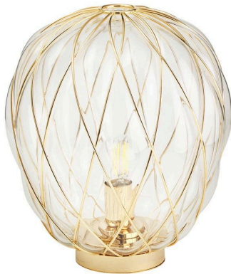
Table lamp with diffused and dimmable light. Transparent enclosed glass diffuser. Cage and base made of galvanized metal. Transparent power cable, dimmer and plug. European two-pole plug. Bulb not included.

Pinecone is a suspension and table lamp. The diffuser is manufactured using the ancient caged blown glass technique: the glass maker blows the molten glass blob into a metal cage, which only partly contains the blob's natural expansion. In this way, the glass surface is partly trapped by and partly escapes the cage, generating an impression of tension as the object struggles to free itself from its harness; the cage is further enriched by the galvanic treatment that makes it look glossy and brilliant. The transparent version, in particular, reveals a two-fold structure that multiplies the scenic effect, while the metal cage pattern projects kaleidoscopic shade effects on the surrounding surfaces. On the contrary, in the white version the glass delicately envelops the cage surface and enhances its geometric pattern, generating an elegant and visually pleasing diffused light. The lighting fixture makes a highly appealing and striking impact either switched on or off.