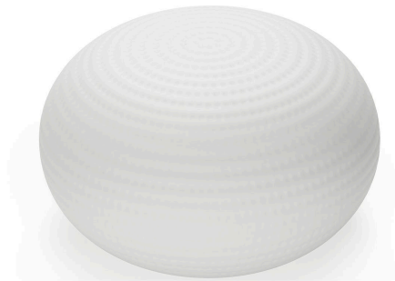
Table lamp with diffused and button-dimmable light. Milk-white diffuser made of blown glass with satin-finish. Painted metal frame. Transparent power cable, dimmer and plug. European two-pole plug. Bulb not included.

Bianca is a family of luminaires with the decoration on the diffuser surface features an orderly series of shallow delicate grooves etched into the white glass, yielding an effect resembling small footprints on fresh snow. Mouth blown, belt sanded and dipped in acid to obtain the distinctive 'silk effect' typical of fine glassware, Bianca diffusers are available in three different diameters to complete all thirteen types of luminaires belonging to the family. The largest diffuser has a 50 cm diameter and, owing to its dimensions and the amount of glass involved, continues to pose a considerable challenge even for the ablest of glassblowers trained in the fixed-mould blowing technique, which – according to the traditional Venetian production process – is performed without any external aids for turning and shaping the glass blob inside the mould, but relies solely on the glassblower's skill and lung capacity. Bianca is available in the following versions: table-top without stem, floor-standing with base and stem, pendant, wall-mounted and ceiling-mounted. The matt white coating applied to the various metal supports evokes the name and colour of the diffuser. Bianca produces a very warm, diffused and enveloping light emission in the surrounding environment.