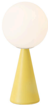
Table lamp with diffused light not dimmable. Painted metal frame. Diffuser made of white blown glass with satin-finish. Transparent power cable, plug and switch. European two-pole plug. Bulb not included.

Nothing more than a sphere, set in an apparently impossible feat of balance, upon a cone that serves as the base. One of Gio Ponti's many compositional magic tricks, designed in 1932. The counterbalancing of two elementary geometric forms results in an original, perfectly proportioned object. An unpretentious composition, enriched by the extraordinary balance of its proportions and the stylish discretion of non-reflective materials. The light is diffused and valorized by the geometrical simplicity of the design. In designing Bilia, Gio Ponti imagined a smaller version in a range of "spray colours". From those handwritten notes of the original project, FontanaArte presents Bilia Mini in new breathtaking chromatic variations.