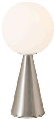
Table lamp with diffused light and dimmable by switch button. Frame made of brushed nickel-plated metal. Diffuser made of white blown glass with satin-finish. Transparent power cable, dimmer and plug. European two-pole plug. Bulb not included.

Nothing more than a sphere, set in an apparently impossible feat of balance, upon a cone that serves as the base. One of Gio Ponti's many compositional magic tricks, designed in 1932. The counterbalancing of two elementary geometric forms results in an original, perfectly proportioned object. An unpretentious composition, enriched by the extraordinary balance of its proportions and the stylish discretion of non-reflective materials. The light is diffused and valorized by the geometrical simplicity of the design. In designing Bilia, Gio Ponti imagined a smaller version in a range of "spray colours". From those handwritten notes of the original project, FontanaArte presents Bilia Mini in new breathtaking chromatic variations.