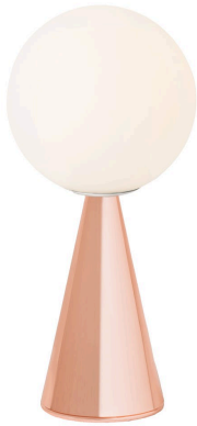
Table lamp with diffused light and dimmable by switch button. Galvanized metal frame. Diffuser made of white blown glass with satin-finish. Transparent power cable, dimmer and plug. European two-pole plug. Bulb not included.

Nothing more than a sphere, set in an apparently impossible feat of balance, upon a cone that serves as the base. One of Gio Ponti's many compositional magic tricks, designed in 1932. The counterbalancing of two elementary geometric forms results in an original, perfectly proportioned object. An unpretentious composition, enriched by the extraordinary balance of its proportions and the stylish discretion of non-reflective materials. The light is diffused and valorized by the geometrical simplicity of the design. In designing Bilia, Gio Ponti imagined a smaller version in a range of "spray colours". From those handwritten notes of the original project, FontanaArte presents Bilia Mini in new breathtaking chromatic variations.