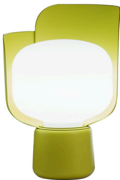
Table lamp with diffused light adjustable by moving the petals. Frame made of painted aluminium with polycarbonate petals. Diffuser made of milk-white and opaline polyethylene. Transparent power cable, plug and switch. European two-pole plug. Bulb not included.

Blom is a small table lamp by Andreas Engesvik, a Norwegian designer who has made a name for himself on the international scene thanks to his ability to instil emotions, appeal and ideas into everyday objects. Taking up very little space, just 24 cm tall with a diameter of 15 cm, Blom is a light, fun lamp that is easy to pick up and move and suitable for any purpose. Its name, a contraction of the word blomst, which in Norwegian means flower, is inspired by its petal shaped blades. Intensity can be adjusted thanks to the two petals that gently embrace the diffuser, rotating on the base to shield the glare depending on personal requirements: with the petals aligned the lamp emits maximum light. The compact fluorescent bulb guarantees good effective lighting with low energy consumption. The metal base ensures stability for the lamp and when lit, the polycarbonate petals maintain a temperature that permits touching without the risk of burns. Blom is an article that adapts perfectly to contemporary living trends, at home on a table in the lounge or even by a bedside.